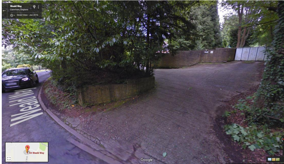
Driveway access to house

Address: 54 Weald Way, Caterham, Surrey, CR3 6EJ